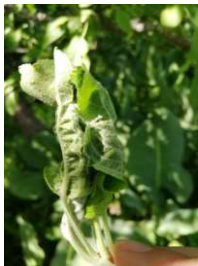
Fig. 1: A. rosana larvae in folds of the apple tree leaves (the site no. 1, the Aksai gorge)

Egg maturation occurs throughout the entire period of the egg laying; it happens periodically at intervals of 2-4 days. The mass oviposition lasts 15-20 days starting from mid July. Eggs are laid on smooth parts of the bark. An egg clutch was observed to contain 55 eggs in average (from 13 to 146 eggs). The first clutches are the most numerous, then they reduce in number. Mainly observed in small clutches, non-viable eggs increase in number to the end of an imago life. Eggs in a clutch are of dark colour; they are laid in tree crutches, in crevices and cavities of the bark (Smirnov and Ovsyannikova, 2012). Clutches were observed to be laid also on leaves.