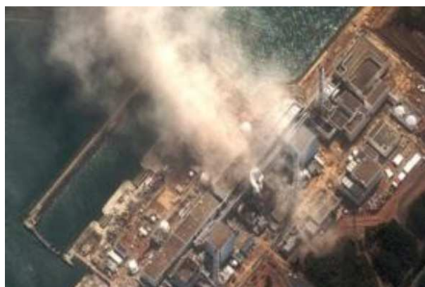
Fig. 1: The explosion in Fukushima of reactors No. 1, 3, 4