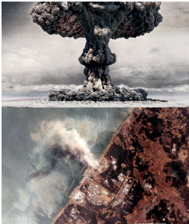
Fig. 2: Chernobyl nuclear explosion of 30 years ago (1986)

Here is the time for us to ponder least and to make a small comment. When we say that the energy donated by hydrogen is amiable, we are referring in general at her, but in particular to the nuclear fusion. Nuclear energy for fission has given us and many problems unpleasant over time. But still it has been and that who made us out from the energy crisis installed on the Earth, since years 1950-1970. Without nuclear energy for fission, mankind was collapse. It can be said that this energy, represented, to humanity, a big harm necessary. Want the images in Fig. 2 to remember us for a moment about the Chernobyl nuclear explosion of 30 years ago (1986).