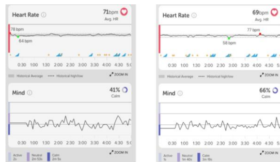
Fig. 2: Results of a 5-minute unguided neurofeedback training session "heart session healing drum" following the instruction of the muse EEG system. Left panel: before application of the cream. Right panel: after application of the cream