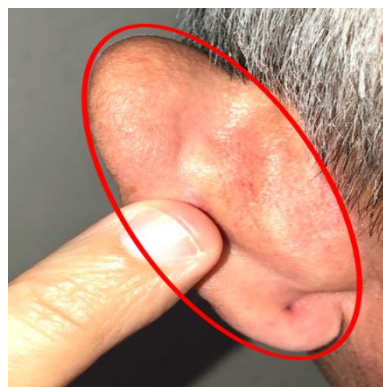
Fig. 1: Area of application of the cream. This area of the skin is one of the thinnest in the human body and is highly vascularized. It is an area commonly used in auriculotherapy (Correa et al. , 2020). The cream was gently rubbed for about 30 sec

The results described in Fig. 2 appear to be independent of the type of neurofeedback training session among those proposed by the Muse app. For example, the following day, approximately 24 h after the observation described in Fig. 2, the author performed other two 5 min unguided sessions, this time with a program denominated "Mind Session Desert" observing superimposable results in terms of an increase of calmness following application of the cream (Fig. 3).