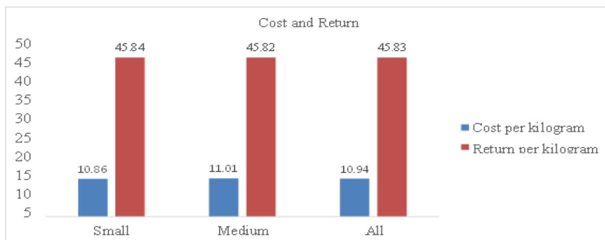
Fig. 1: Cost and return per kilogram