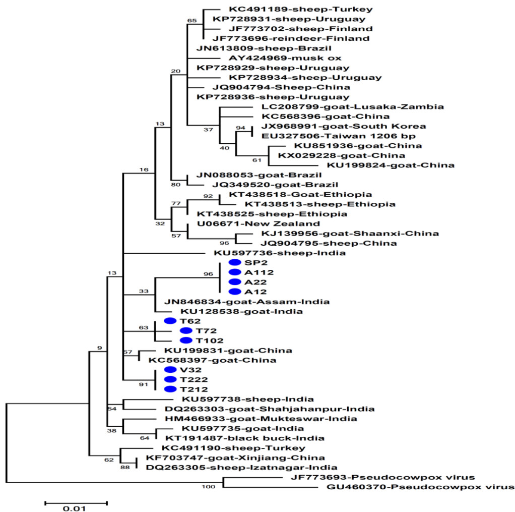
Fig. 1: Phylogenetic tree