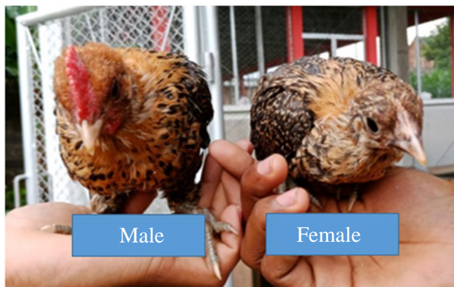
Fig. 2: The differences in the secondary sex signs of 4 weeks old Arabic Gold chicks. Male Arabic chicks show red and thicker combs, while female Arabic chicks have thinner combs